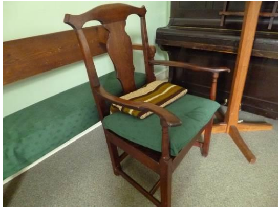
Fig.4: chair from Pardshaw meeting