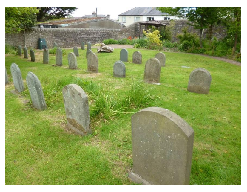
Fig.5: burial ground from the south-west

(subject to tree preservation orders) along the north side, and a late twentieth century garden area in the south-east corner. Part of the area was landscaped in 2000 to provide a paved play area at the west end, and a wooden fence separates the east front of the meeting house from the garden.