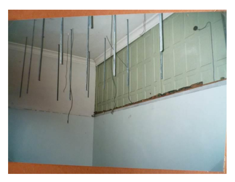
Fig.2: panelled shutters in situ above suspended ceiling, 2007