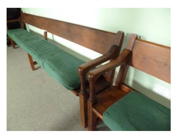
Fig.3: loose benches in meeting room

The meeting room has a collection of pine benches with turned front legs, which are the same as those in Pardshaw and were brought here at an unknown date. The chair with arms is also from Pardshaw, and probably dates from the late eighteenth or early nineteenth century.